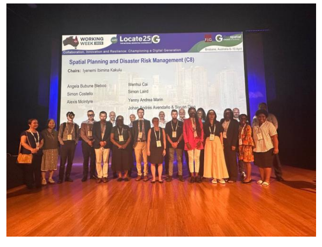
Paper Presentation at Commission 8.