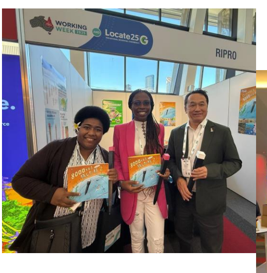
At The Exhibition Booths