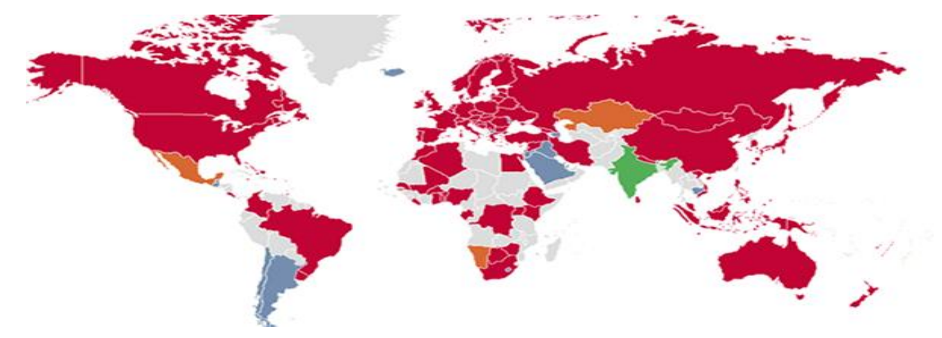
FIG is a: