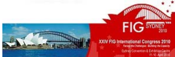
FIG Congress Sydney 2010: Facing the Challenges – Building the Capacity 11 - 16 April, 2010 Sydney, Australia

During the Congress the following ten Technical Sessions will be organized by Commission 2: