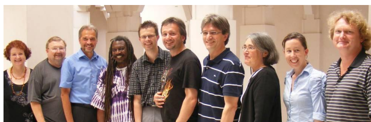
FIG 2011-14 Commission Chairs

http://www.fig.net/commission5/steering_committee/steeringcommittee.htm