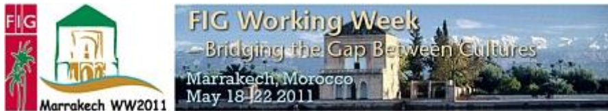
FIG Working Week 2011 - Bridging the Gap between Cultures - Marrakech, Morocco, 18-22 May 2011

Welcome to FIG Commission 5's June 2011 e-Newsletter. In this edition you will read about the activities of our Commission at the Working Week in Marrakech. Please feel free to distribute this newsletter to colleagues and friends.