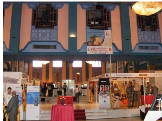
Palais De Congres