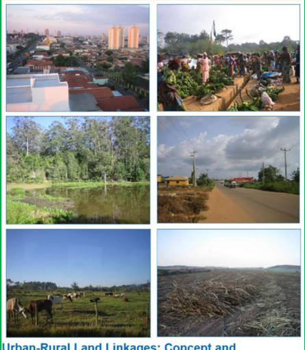
Urban-Rural Land Linkages: Concept and Framework for Action

'8.1 Rural - urban dependency' from commission 8) led the drafting of the URLLs report. The report is currently undergoing editing with the UN-Habitat for possible publication and dissemination to the global surveying and land practitioner's community. Urban and rural spaces are inextricably linked economically, socially, and environmentally. Hence, the development discourse must depart from urban and rural dichotomy, but rather adopt an integrated and inclusive approach. Central to this is the need to understand the urban-rural land linkages particularly in addressing land governance and land tenure challenges. At the e-Working Week in 2021 a joint GLTN / FIG session will be organised to launch the "Urban-Rural Land Linkages: Concept and Framework for Action" report.