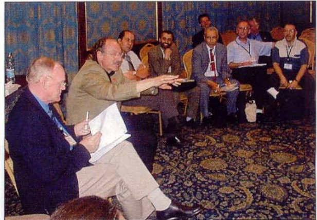
Round table meeting on education in Africa and Middle East at the FIG/GSDI conference in Cairo in 2005.

FIG as “mother of all surveying and surveyors” is that all surveyors around the world feel solidarity and strength of unity. That is the best basis for coping with the changes into a unknown future.