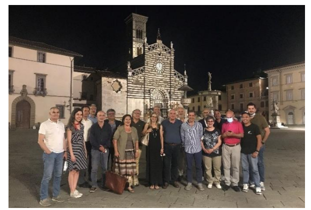
Beautiful Prato, Italian evening