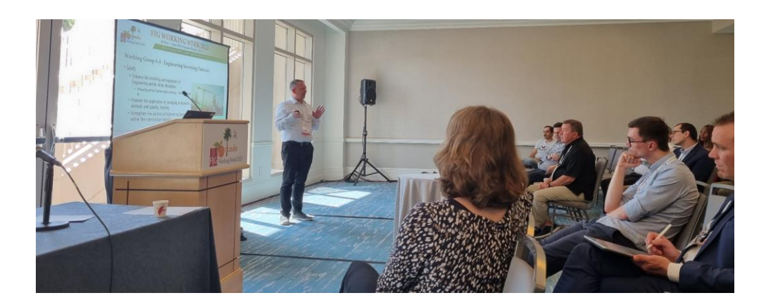
Fig. 2: Annual Meeting of Comm. 6

In order to promote the activities of Commission 6, a linked in page was set up and all working group chairs are active content-admins.