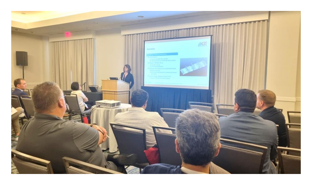
Fig. 1: Comm. 6 Presentations at the FIG Working Week 2023

Commission 6 had a very successful presence at the Working Week 2023 in Orlando. The pre-conference workshop on Multi-Sensor Systems (Fig. 1) was well attended and the audience was very involved in lively discussions. Furthermore Commission 6 was involved in the organization of 5 technical sessions. 2 of them were organized jointly with Commission 6. All gained at a lot of interest and the seminar rooms were fully occupied.