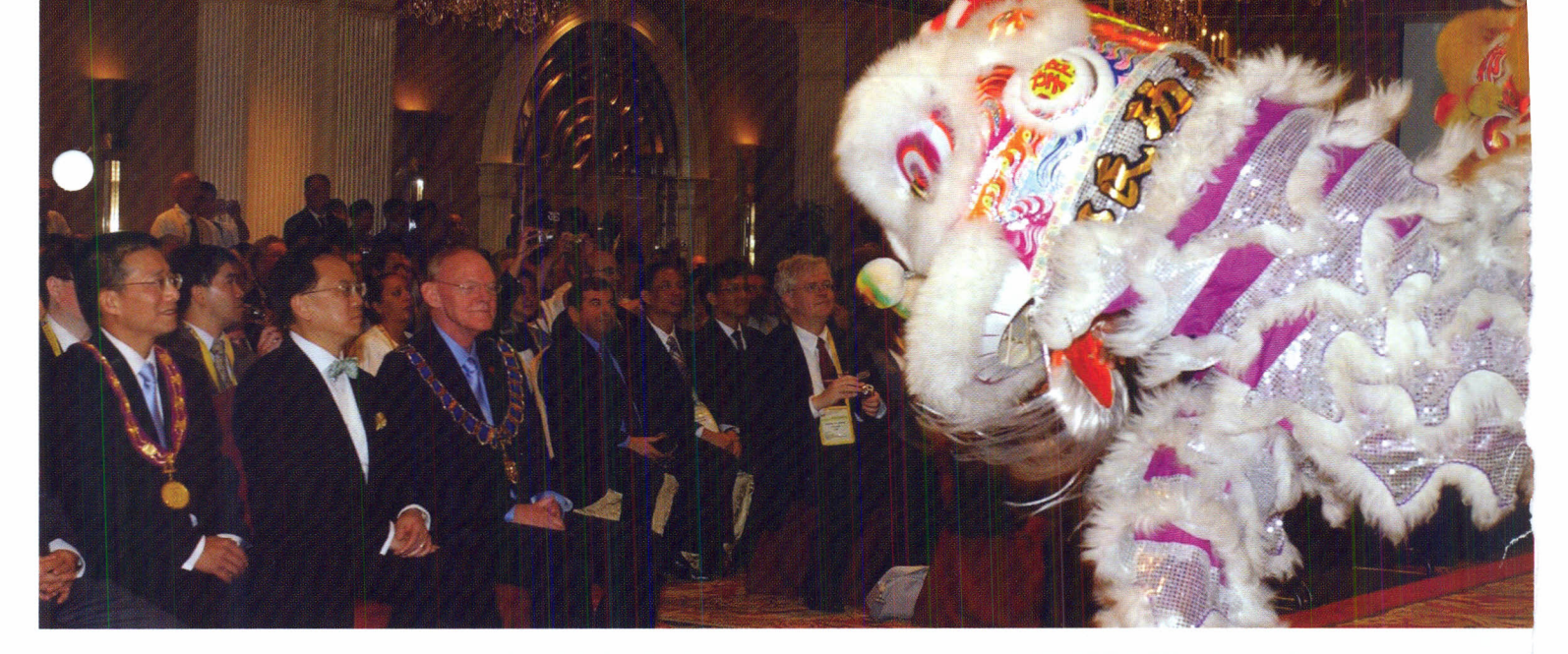
FIG WORKING WEEK 2007 HONG KONG

WINNIE SHIU REPORTS ON THE INTERNATIONAL FEDERATION OF SURVEYORS (FIG.) MEETING HOSTED BY HONG KONG INSTITUTE OF SURVEYORS, MAY 2007