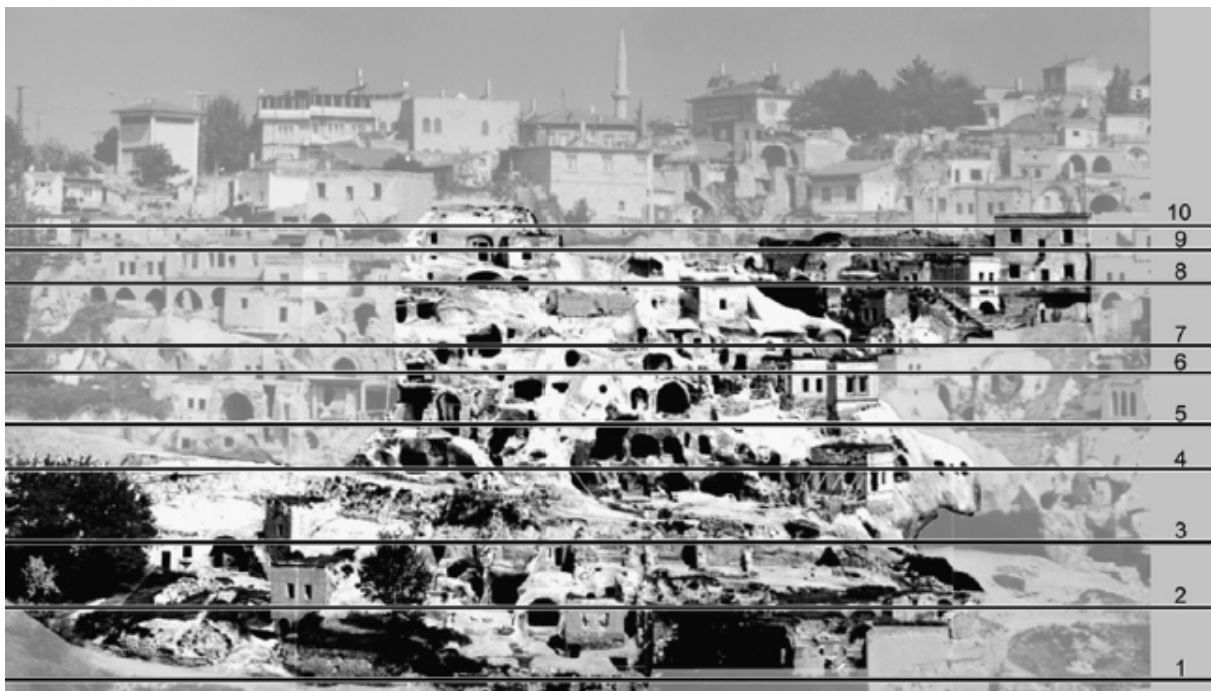
Figure 2: Location of the sections (Aslan et al, 2002)

Legal registration problems could be solved by establishing rights such as easements, superficies. However, it was not possible to represent all the properties on cadastre map because of complex configuration of the situation. Therefore, the properties located tops of each other are currently displayed on the cadastre map with their approximate location as written.