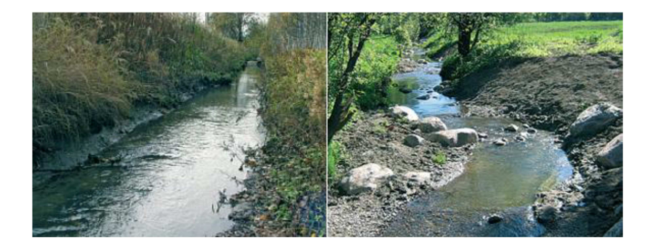
Picture 4. Longinoja ditch in Helsinki before and after repairing works.(Näreaho ym. 2006, pp. 32–33)