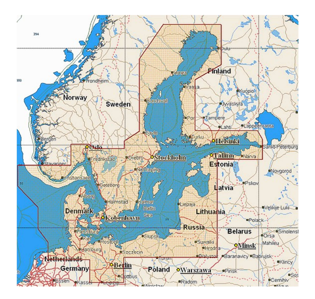
Picture 2. The Baltic Sea and costal states (http://www.marinea.fi/shop/product_details.php?p=1234).

Algal blooms of The Baltic Sea have repeated now every summer. Many lakes are paludificating because of eutrophication. Condition of water is affecting to nature, recreation and outdoor activities, fishing industry and attractive living environment. The nature of the Baltic Sea is especially vulnerable, because only very few species are adjusted to live in low-slated seawater (HELCOM 2010).