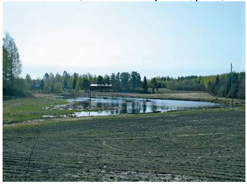
Picture 4. A wetland in the low-lying part of the field, which has bad cultivation qualities. (Puustinen ym. 2007)

Measures outside of fields can be divided to areas of wetlands and areas of sedimentations basins. There is also possible to use natural hydraulic engineering methods to reduce loads. Wetlands are good in refining waters from arable land areas. In the waters of these areas there are lots of plants and microbes, which reduce amounts of phosphor and nitrogen. (Eskola ym. 2009, p. 20.) A sedimentations basin is a water basin, which is linked to a ditch or a brook. It differs from a wetland because there is not particular wetland vegetation in a sedimentation basin. In this case solid materials fall down to the bottom of the basin. A sedimentation basin shall reduce drifts of solid materials, but not reduces nutrient load of waters as a wetland does. (Paasonen-Kivekäs ym. 2009, p. 259.)