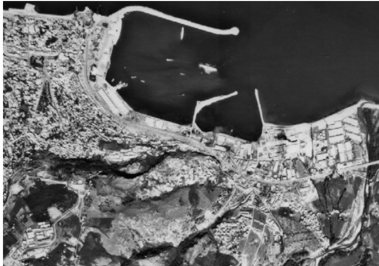
Fig. 4: The old dated image covering coastal zone in the study area

The hardware and software used in the study included Z/I Imaging SSK digital photogrammetric system working on workstation and MicroStation V8 from Bentley. Imagery was processed in SSK performing model orientation and extracting topographic features. Because of the nature of the triangulation algorithms in SSK, some ground control points are required to give initial approximations of the model, as both the relative and absolute orientation stages are performed simultaneously. Four ground control points were scaled from existing mapping and measured in one stereo pair. After the model oriented from the images in 1973 and 2002, respectively, the coastal line and other topographic features were measured.