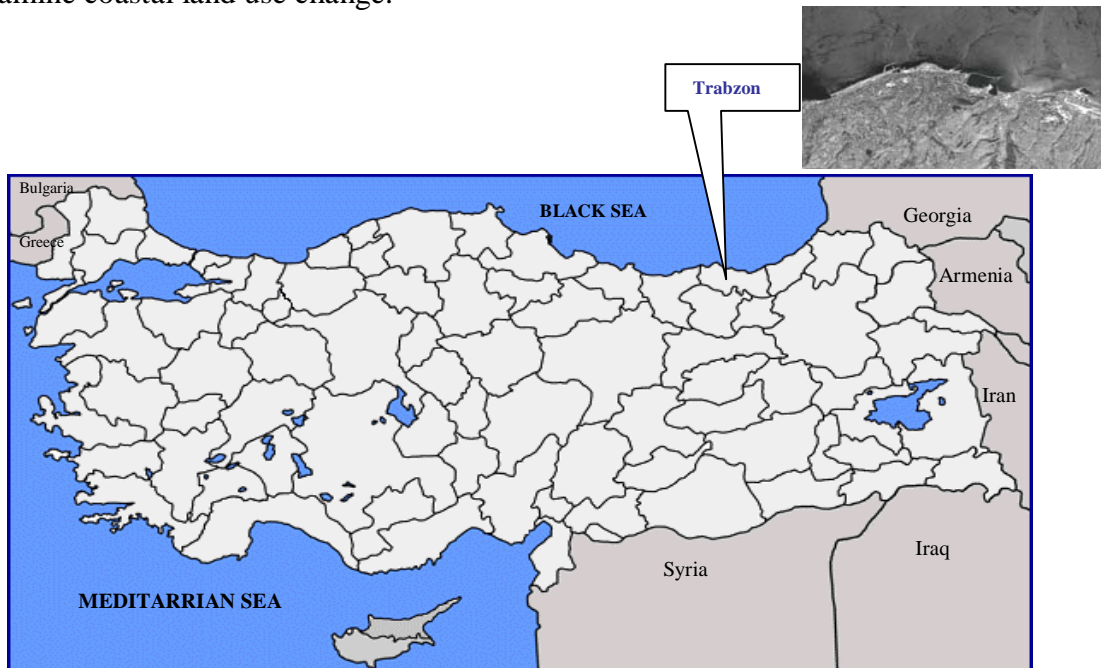
Fig. 3: Location map of the study area

As shown in Figure 3, the study area, Trabzon, is located in the north-east of Turkey and is about 3 km length of coastal zone. The city centre and its coastal zone were dealt with to examine coastal land use change.