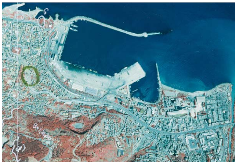
Fig. 5: The new dated image covering coastal zone in the study area

The hardware and software used in the study included Z/I Imaging SSK digital photogrammetric system working on workstation and MicroStation V8 from Bentley. Imagery was processed in SSK performing model orientation and extracting topographic features. Because of the nature of the triangulation algorithms in SSK, some ground control points are required to give initial approximations of the model, as both the relative and absolute orientation stages are performed simultaneously. Four ground control points were scaled from existing mapping and measured in one stereo pair. After the model oriented from the images in 1973 and 2002, respectively, the coastal line and other topographic features were measured.