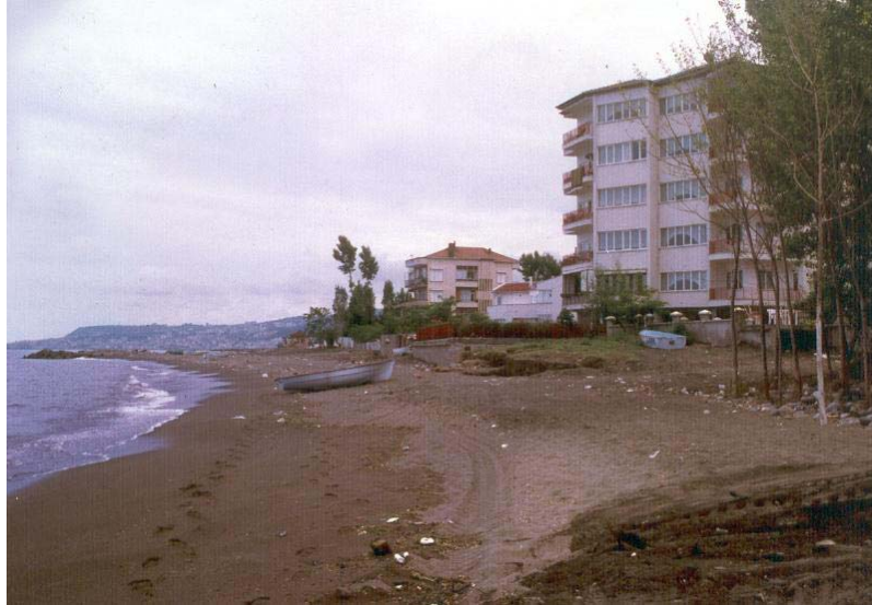
Fig. 1: The Example of land use violating the law in Trabzon