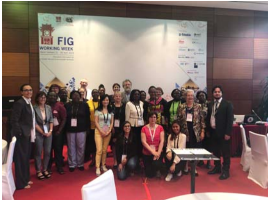
Round Table Discussion by Robyn McCutcheon

therefore all members of the FIG community are invited to contribute.