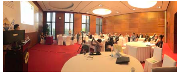
Round Table Discussion by Nigel Sellars