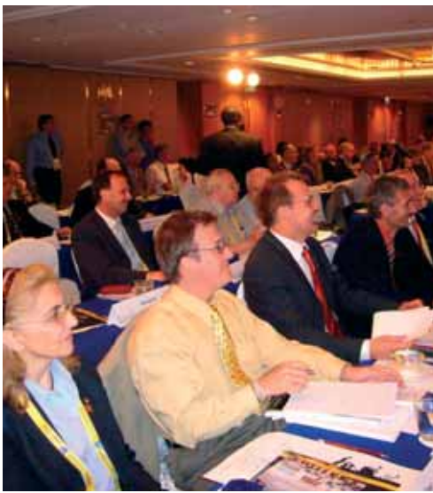
FIG Statutes, Internal Rules and Guidelines